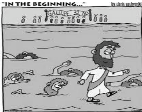
Consequently, Jesus was banned from further triathlons...

Today's Gospel contains a strong challenge! Jesus is among Gentiles in Tyre and Sidon. A Canaanite woman approaches and shouts for help. The disciples tell Jesus to send her away! Her daughter is tormented by a demon, and she knows that Jesus can heal her. She is desperate, and goes as far as calling Jesus, Son of David! She knew who he was! To a Hebrew, a Canaanite , was like calling someone a pagan! The Hebrews often called pagans, dogs , whereas they, the chosen people, called themselves, children of God . Jesus used this occasion to open his disciples' hearts and eyes! He gave them an example of what would become their work in the future - to spread the Good News to all who have faith , no matter their nationality! That means being open and accepting towards the outsider... towards everyone. Jesus saw the faith of this woman and he healed her daughter from a demon! What can we learn from that? Jesus overcame the barriers that the disciples and the people had created: ethnic, cultural, political, gender, and religious barriers! Everyone matters to God! And so it should be for us!